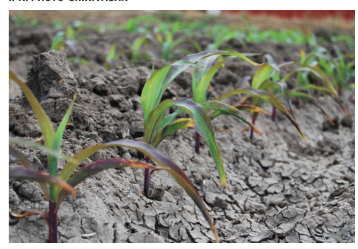
Phosphorus-deficient corn plants.

the quality of fruit, vegetable and grain crops, and is vital to seed formation. Adequate P increases plant water use efficiency, improves the efficiency of other nutrients such as N, contributes to disease resistance in some plants, helps plants cope with cold temperatures and moisture stress, hastens plant maturity, and protects the environment through better plant growth.