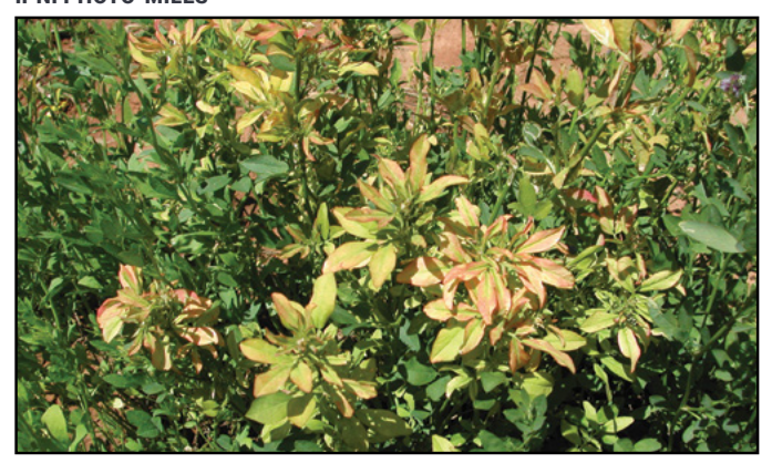
Boron deficiency in alfalfa is often seen

Corn: narrow white to transparent lengthwise streaks on leaves, multiple but small and abnormal ears with very short silk, small tassels with some branches emerging dead, and small, shrivelled anthers devoid of pollen.